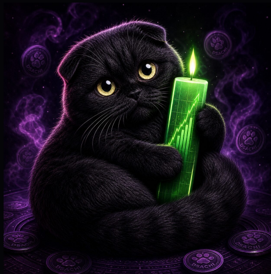
SACHI · GUARDIAN OF THE GREEN CANDLE

Sachi is the emotional center of the project. She is not just a logo or mascot; she is the voice, mythology, and social engine of the brand.